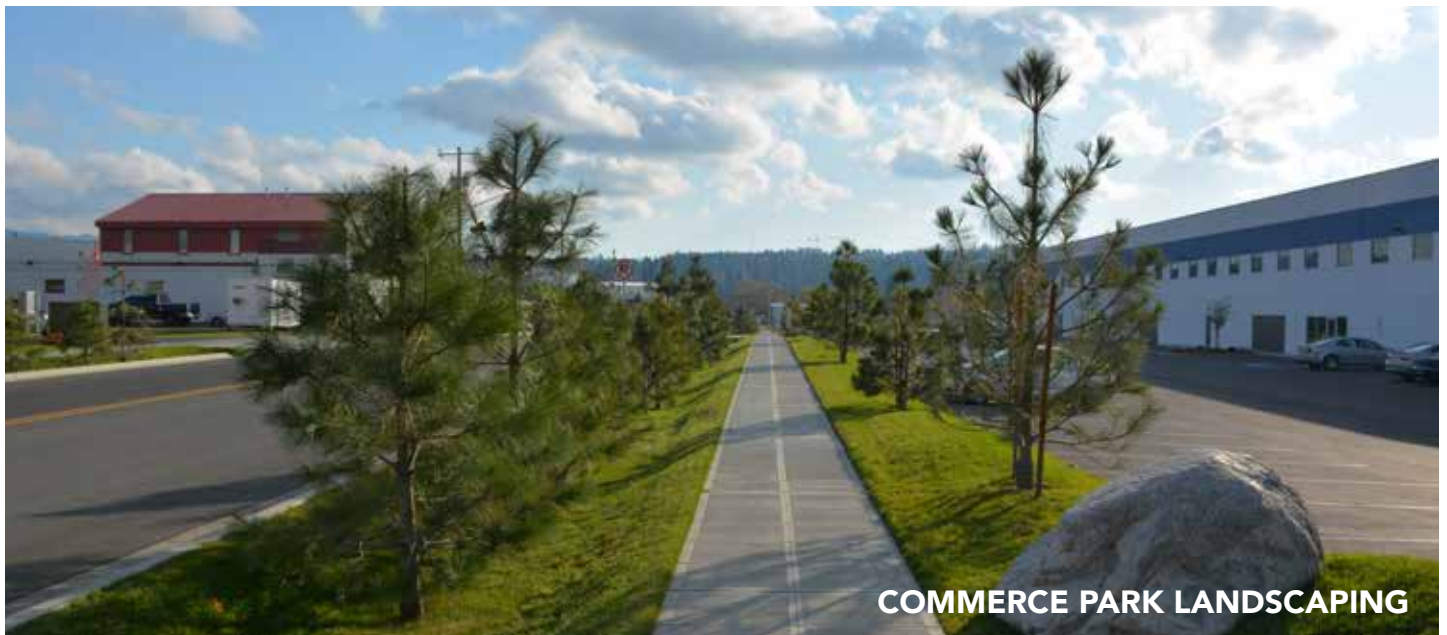
COMMERCE PARK LANDSCAPING