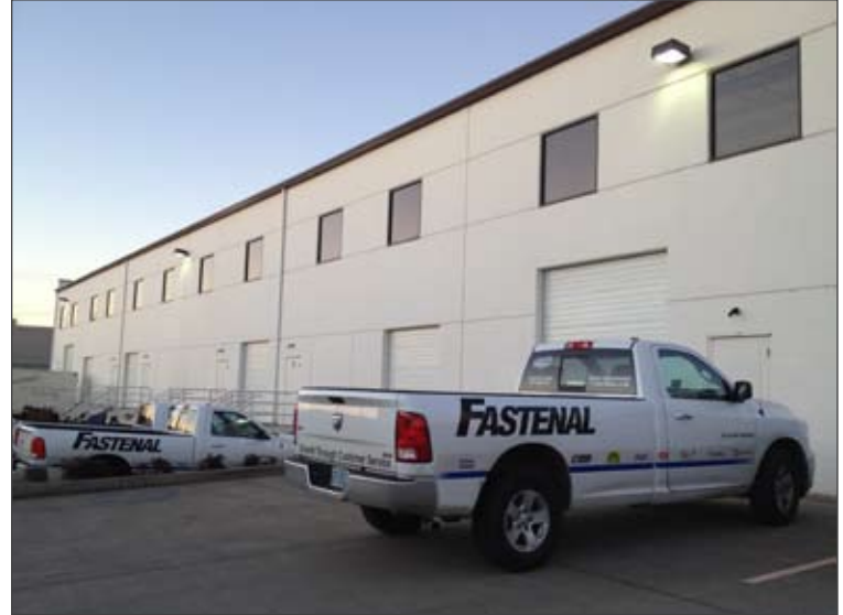
2980 19th Street SE