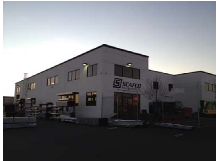
2019 - 2025 Vista Ave SE